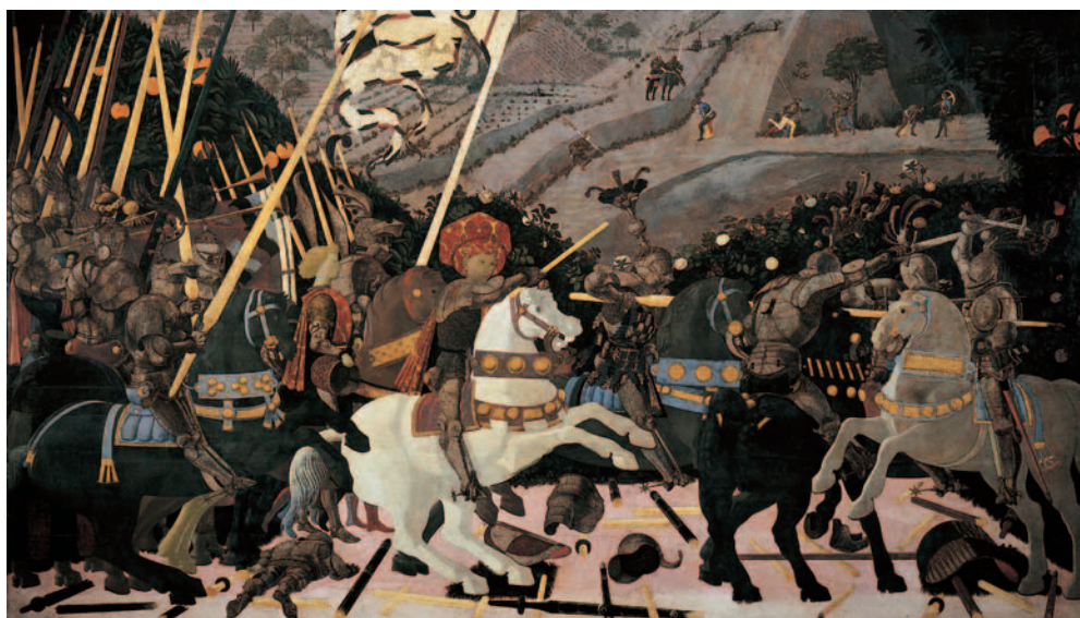
Figure 1. Paolo Uccello. The Rout of San Romano. ca.1440. National Gallery, London.

geometrical and prominent, such as Masaccio's Trinity and Piero della Francesca's Flagellation. However, when the depiction does not involve such obvious motifs as tiled floors and architecture, the perspectival techniques are necessarily more implicit and less immediately evident. It might seem obvious that landscape settings would not lend themselves to geometrical plotting. However, such was the conviction of some artists that there were underlying orders both in nature and in the act of seeing that every naturalistic representation demanded a systematic plotting of forms in space.