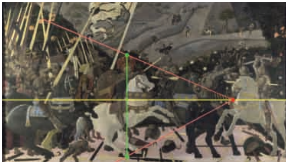
Figure 7. The red point shows the direction in which we wish Niccolò da Tolentino and his grey horse to move.

The evidence is not such as to provide cast iron evidence of the precise disposition of the “ghost pavement”, but the one we are proposing is the kind of construction that would have existed under the paint surface or in a scaled drawing. Some items in the debris lie slightly off-line, no doubt to avoid what even for Uccello would have been excessively improbable tidiness.