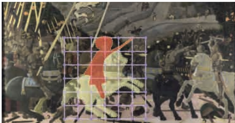
Figure 6. The same grid units of fig. 5 can also be used to measure heights. Niccolò da Tolentino is approximately four units tall, consistently with what found in fig. 5. Interestingly, the whole knight and horse figure is inscribed in a 6x6 square grid.