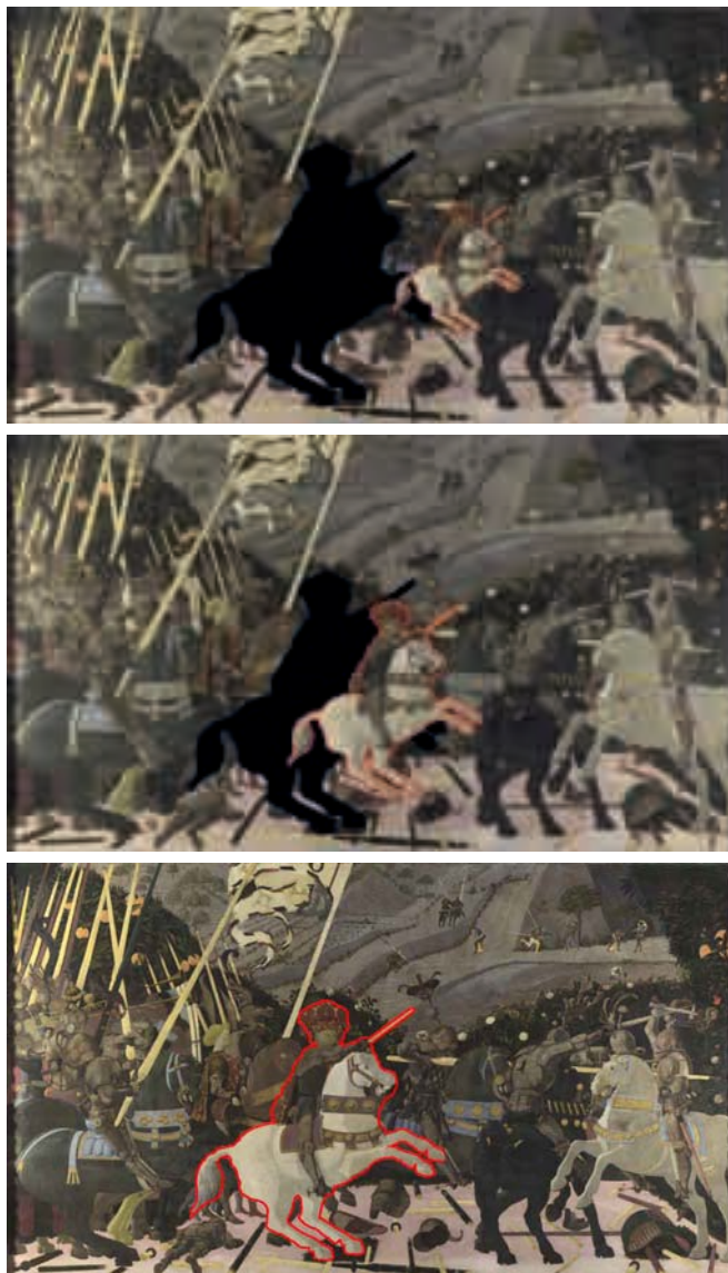
Figure 8. The geometry computed for the ground plane allows us to make Niccolò da Tolentino and his horse move back and forth in the direction of choice in a realistic way; i.e. in a way which is consistent with the overall geometry of the painting.

What Uccello has achieved is a fine balance of decorative complexity and geometrical order, as was fitting in a work which served as part of a decorative ensemble in a domestic palace (originally of the Bartolini Salimbeni family and later of the Medici) and as a patriotic rendering of the famous Florentine victory. Decorative chivalry was a real feature of Renaissance battles, but commanders would have killed to achieve such spatial order in an actual engagement. ■■■