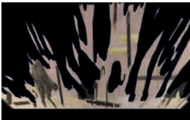
Figure 5. The rectified floor. In this figure the red/green grid of figure 2 has been rectified together with the ground plane. Now the grid is made of perfectly square elements which can be used as measurement unit. The dead soldier is approximately four units tall.