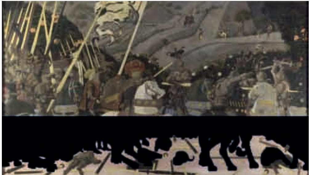
Figure 3. The rectification process applies only to objects lying on the ground plane. Therefore, before rectification is applied we need to mask out all the objects which do not lie on the floor. This process eases visualization.

4. Martin Kemp, The Science of Art. Optical Themes in Western Art from Brunelleschi to Seurat , Yale University Press, London and New Haven, pp. 37-41